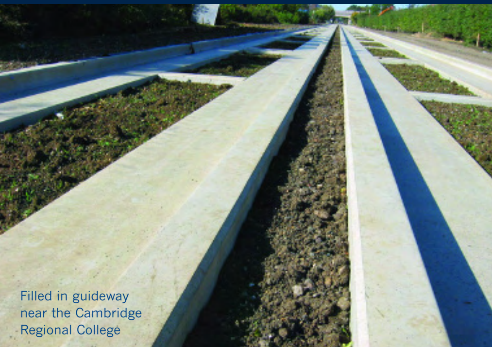
Filled in guideway near the Cambridge Regional College

The bus stops along the busway will also be built over the coming months. More information on the bus stops can be found on page 3 of this newsletter.