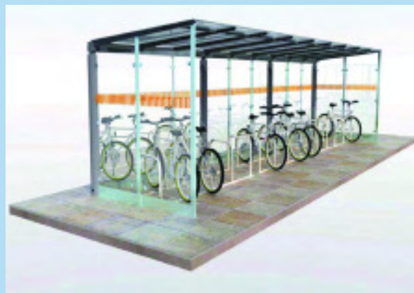
Artist impression of cycle parking at guided busway stop

In addition, bus stops along the guided busway will be fitted with ample cycle parking.