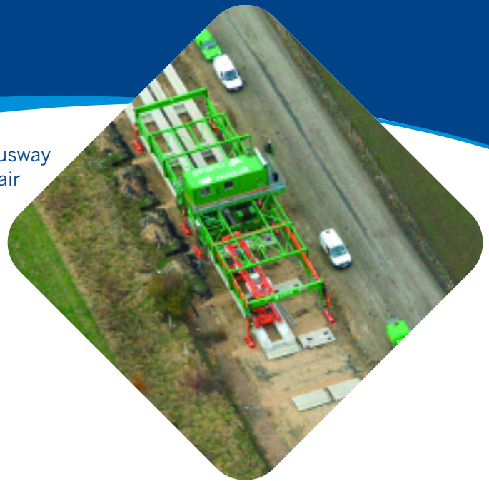
Guided busway from the air