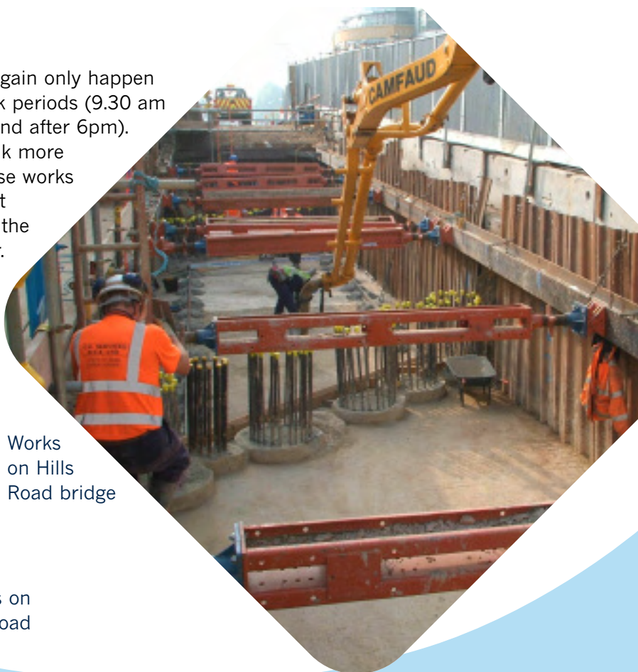
Works on Hills Road bridge

This will again only happen in off-peak periods (9.30 am to 4 pm and after 6pm). We will talk more about these works in the next edition of the newsletter.