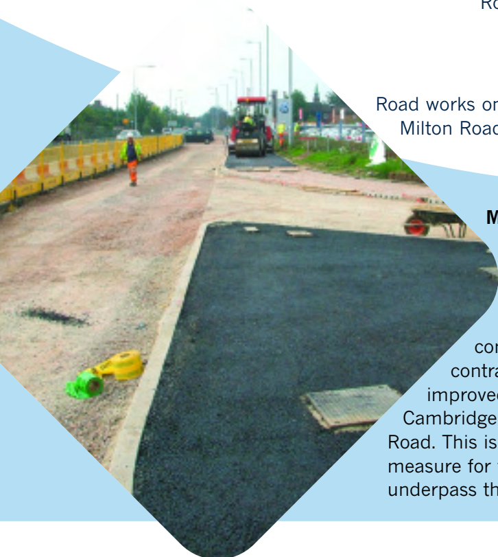
Road works on Milton Road