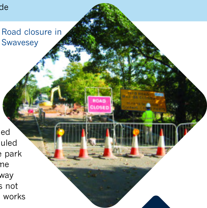
Road closure in Swavesey

Further works for a new junction to access the planned park and ride site are scheduled to start in winter 08/09. The park and ride junction will be some distance away from the busway junction and therefore it was not possible to do both junction works at the same time.